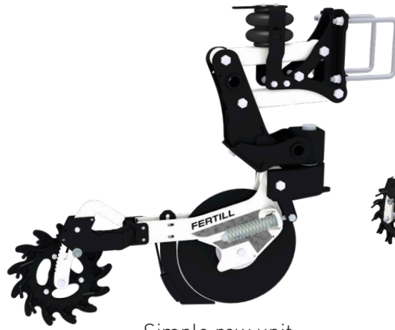
Simple row unit

This disc injector mounted on a parallelogram damped on air unit is guided by an oscillating arm. This allows to work at high speeds even in the presence of residue. Single or twin row elements make it possible to adapt perfectly to each spacing.