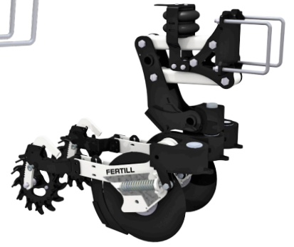
Twin row unit